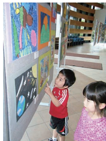
Where is the child who painted this picture from?

The local news, newspapers, magazines and other forms of media widely reported about our event this time, and more than eight hundred people visited the exhibition in 5 days. What kind of message did those who came to the exhibition receive from the children's paintings? We believe that, through the event, the idea of "KIDS HELPING KIDS" would be understood and spread in Canada.