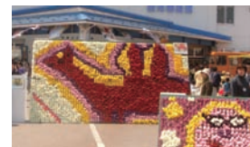
Several flower arrangements designed from children's paintings were displayed during the event. A miniature PORTRUM was donated to Kids Earth Fund.

The pictures painted at the art workshops will be displayed in various places in Japan. "Flower PORTRUM", filled with the spirit of children from around the world - including children from Japan, will be in operation until the end of October.