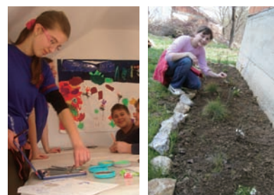
Children enjoy making art with smiles at the workroom on the 2nd floor. Trees and flowers planted by children are growing in the big garden

Children who come to the new HOME go straight to the workroom at the second floor as if it's their daily routine since a long time ago. At the workroom, "URASHIMA TARO" drawing, which was donated by exchange donation from SHISEI GAKUEN welcomes them. Children spend their fun time playing with friends or drawing pictures as they wish.