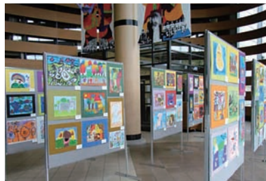
The venue was covered with 300 paintings of children

From May 12 to 16, KIDS EARTH FUND's art exhibition, "Children's Impressions 2009," was held in the lobby of National Nikkei Museum & Heritage Centre in Burnaby, Canada. Kids Earth Fund has conducted charity activities in about 40 countries and art exhibitions in many countries, including Centre Georges Pompidou in Paris and Pushkin Museum in Moscow, but this was the first time for us to hold an art exhibition in Canada. This exhibition was realized with support of National Nikkei Museum & Heritage Centre and Japanese Consulate General in Canada as well as many individuals.