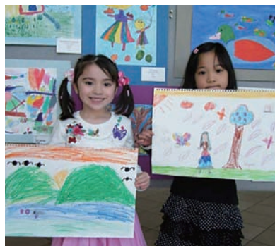
A number of local children donated their paintings and funds to Kids Earth Fund

Picture books, post cards and other KEF goodies with children's paintings on them were sold at the museum, and a lot of people made donations for children all around the world.