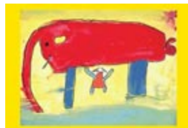
Children who participated in designing this year from Croatia, China, Malaysia, U.S. and others.