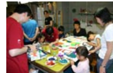
Children working on their art with serious expressions.

Cross-cultural exchange through artwork provided by KIDS EARTH HOME (KEH) No.1 in Croatia and an orphanage, Shisei Gakuen has entered its 4th year. This year Croatian children expressed stories of their hometown (Topusko city and Gvozd city) in their drawings and gave it to Japanese children. In return, Japanese children created "Urashimataro," a Japanese old tale, collage. The art filled with thoughts of Japanese children respecting and remembering Japanese tradition and landscape will be delivered to Croatian children. This cross-cultural exchange brought them closer to each