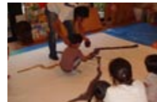
Let's draw a tree trunk on the big paper!

During summer vacation, art workshops were held at KIDS EARTH Gallery every Friday. A lot of children participated in the art workshops and drew paintings to deepen their understanding about various countries in the world and the environment of the earth where they live. The young painters also worked on the paintings to encourage the children who suffered from the Niigata Prefecture Chuetsu-oki earthquake as well as collaboration with the ones who have been in a pediatric ward. From the children's works, you can feel the great energy which surpassed the scorching summer heat. The energy will help more children who need support and bring smiles to their faces.