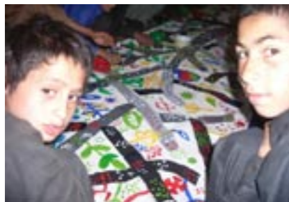
"It is exciting that our drawings could save someone!" voice from Pakistani children