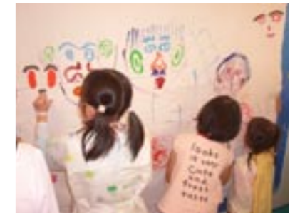
What kind of face should I draw?