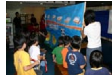
Children all excited looking at the art from Croatia.

Art and culture day between Croatia and Japan - Lets express stories into art-