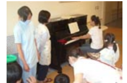
Children enjoy the music.

A mask is a necessary item in a hospital, but some children prefer not to wear one. KEF wishes to eliminate their dislike. On the day of the workshop, a KEF volunteer first played the piano that was donated by Yamaha Corporation. Children clapped their hands and sung songs with big open mouths. Then children stamped a lip shaped sponge on a big canvas and drew a face around the stamped lip. The final process was to wear the hand made mask made by the nurse and nanny! The children were so satisfied and happy with this art workshop concept. (Their work has been used to decorate the hospital.)