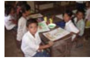
We will do our best in the various classes

An art workshop to think about nature was conducted at KEH No.6 where over 400 children came to attend. This year, KEF decided to build three additional classrooms and begin job training classes (sewing machine and gymnastics) co-sponsored by Sumitomo Mitsui Banking Corporation. Everyone is delighted by this start of classes which will be directly linked to the children's future.