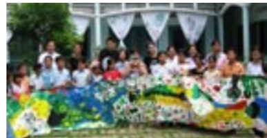
Very excited with presents from Japan!

In spite of it being summer vacation, many children participated in the Painting & Planting Project and completed paintings with the theme of trees. When paintings drawn by Bancho elementary school students were presented, lively messages in the work caused excitement by the children of KEH No.5. In return for the heartwarming gifts, they gave a painting showing their daily jobs (shoeshine, news vendor and lottery ticket seller).