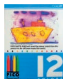
I PICO (12 colors)