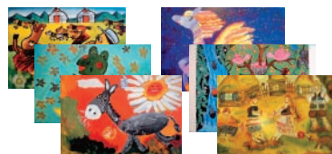
D Post Cards (6 cards)