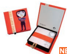
F Memo pad