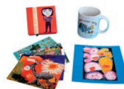
J KIDS EARTH Selection