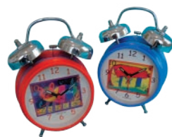
B Alarm Clock (Red / Blue)