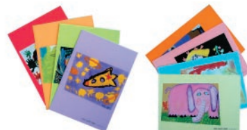
C All Occasion Card Set A (8 cards with envelopes)