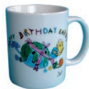
A Coffee Mugs