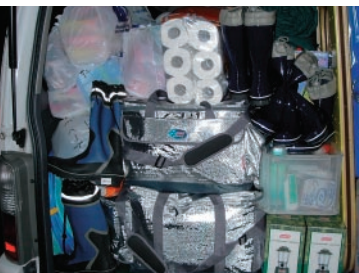
KIDS EARTH CAR filled with supplies.