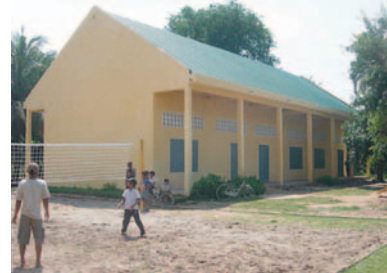
Children in the new school building

KEH No. 6 is located in Kandal Province, Cambodia. This is a poverty stricken area, and about 500 children are receiving primary education in KEH No.6. In the monsoon season, not only the roads, but also the school campus is flooded with water. However, even in those harsh circumstances the children eagerly come to school on foot, often from far off distances.