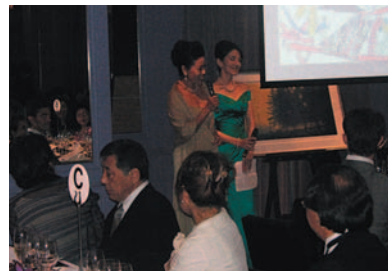
Picture of the party