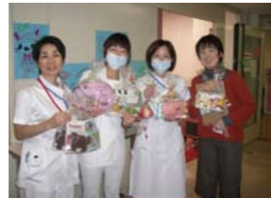
Hospital staff is also greatly pleased

<<Hospitals and institutions >> Ai-no-ie Family Home / Aiiku Yogo School / Children's Cancer Association of Japan / Jikei University Hospital / Kanagawa Children's Medical Center / Keio University Hospital / Kokuritsu Musashino Gakuin / Nippon Medical School Hospital / Nonohana-no-ie / Shisei Gakuen / Showa University Hospital / Toho University Omori Medical Center / Tokyo Medical and Dental University Hospital Faculty of Medicine / Tokyo Medical University Hospital / The University of Tokyo Hospital / and others