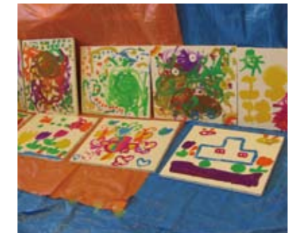
Colorful and masterful paintings by children