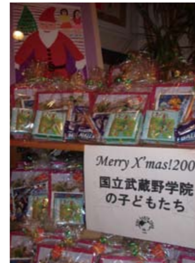
Color pencils and memo pads

<<Sponsors>> Cadbury Japan Limited / Character Research Institute Co., Ltd. / GUERLAIN / KIRIKU Handbell Ensemble / Q'SAI Co., Ltd. / MISSMATCHED JAPAN Co., Ltd. / Newell Rubbermaid Japan Ltd. / sanofi-aventis K.K. / Tombow Pencil Co., Ltd. / We've Inc. / and others