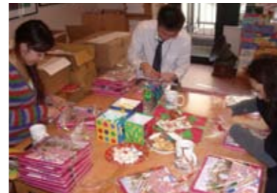
Wrapping work by volunteers

Christmas is the special season every year which children have been waiting for. At the end of year 2007, KEF donated Christmas presents to about 1,300 children in over 16 hospitals and institutions commencing with Tokyo. In Aiiku Yogo School, when children were handed presents from the volunteers, shouts of joy arose from children. Many more children, who have also received picture books in a hospital in Tokyo, have been looking at them happily every day. Moreover many volunteers helped with the wrapping work and the project became a success because many people were able to relate to each other.