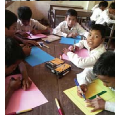
Children in Cambodia