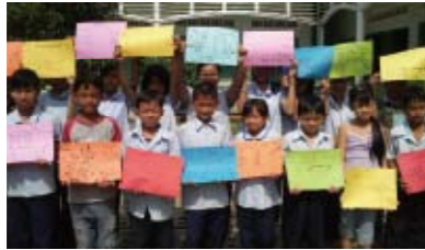
Children and their artwork at KEH in Vietnam

KIDS EARTH FUND (KEF) visited KIDS EARTH HOME (KEH) in Cambodia and Vietnam from February 9. We delivered relief supplies and held an art workshop.