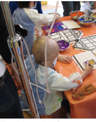
Where do I start painting?

The finished works were later displayed at the KEF 20th anniversary event held in Tokvo Midtown so these children's messages were delivered to others. We hope the children's kindness will reach other children worldwide and charitable actions will continue to spread around the world.