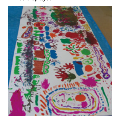
Kids created a large colorful painting!

At the 3rd art workshop this year, we helped 30 children make a large painting together. The participants were divided into two groups, and they worked actively and sensitively. Children in one group were so full of energy that they chose colors without hesitation and started drawing happily. Their energy and ideas could not fit on the canvas we provided for them. so they said, "Let's make another one." In the end, there were three works of art. These three paintings are to be displayed in the hospital corridor, and the children are looking forward to the day when they will be displayed.