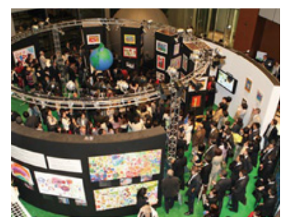
■To have people think more deeply about the earth, children's paintings were displayed on