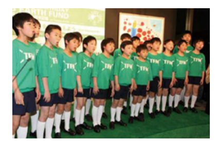
A song written to commemorate this 20th anniversary called "KIDS EARTH Song" was sung by Tokyo FM Boys Choir.