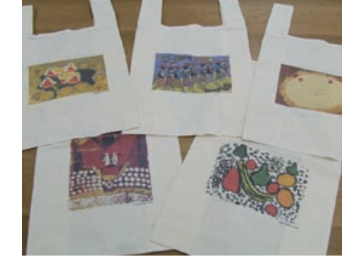
¥525 (including tax)

[MUJI Shinjuku ATELIER] Shinjuku 3-15-15, Shinjuku-ku, Tokyo SHINJUKU PICADERY B1F World's Kids Arts Exhibition Thu, Nov 13rd to Fri, Dec 19th