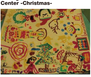
Drawing Christmas is very fun!

Although it was a little bit early, we held an art workshop with a theme of Christmas. Following a child who took an initiative to draw a Christmas tree, other children drew snowmen and wreaths, and in no time the white canvas was covered in colorful pictures of Christmas, and the happy picture, which made us excited just looking at it, was completed. At the end the children said to the nurse, "We want this picture to be displayed in the ward during the Christmas party." The work of children would make the Christmas party more exciting and it would fill the party with smiles. When the picture was moved to another room after the workshop ended, that children's eyes all followed it as if they regretted the temporary separation. It was a memorable scene.