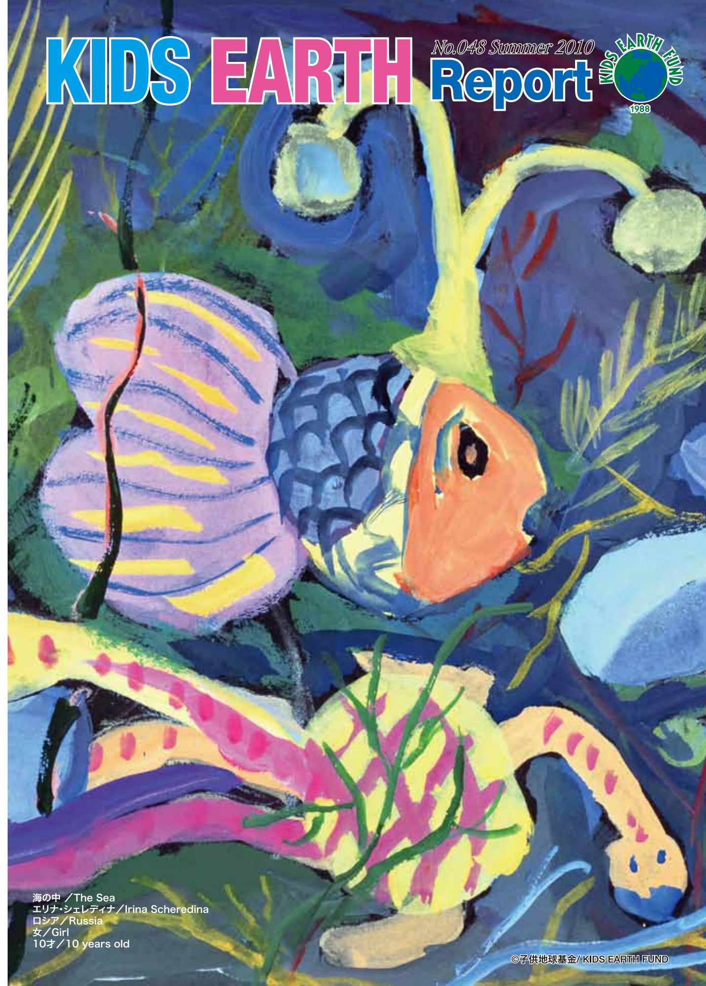
海の中 / The Sea エリナ・シェレディナ / Irina Scheredina ロシア / Russia 女 / Girl 10才 / 10 years old