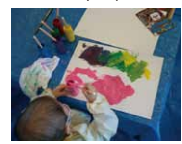
September 14th, November 30th Toho University Medical Center Omori Hospital