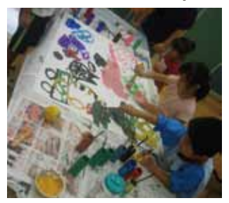
September 9th, October 14th, November 24th Kanagawa Prefectural Children Medical Center