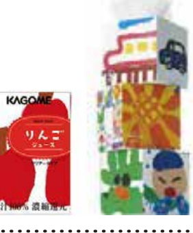
Exhibition at the Calbee Headquarters Monday, December 10th ~ Children's paintings were exhibited at the lobby of the Calbee Headquarters again this year. Christmas paintings from children all over the world were placed on display.