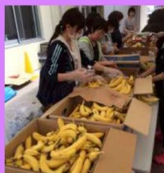
At the evacuation center

One week after the earthquake, we arrived at disaster areas by KIDS EARTH CAR. It had been a few days after the earthquake, however, the school building was still used as an evacuation center due to continuous aftershocks. Therefore, it was unable to know when the classes could be restarted, which imposed stress on children day by day. Some children suffered from sudden allergic symptoms they'd never had, while others had dermatitis and stomatitis. In addition to delivery of supplies, we had workshops for those children to draw pictures at locations including public areas, parking lots and evacuation centers. "In My Mind" was the title of the picture drawn on a big canvas. One of the children said, "I expressed inside my head that had gotten totally mixed up." This infers an enormous amount of stress imposed on children in disaster areas, and how confused they are. The principal of elementary school hit by the earthquake requested us for cooperation, as it was unpredictable when the school could reopen and children's psychological care was the problem needed to be solved. We promised our second visit to support Kumamoto, and headed back to Tokyo.