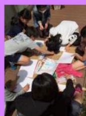
Outside the evacuation center