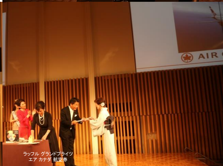
ラッフル グランドプライズ エア カナダ 航空券